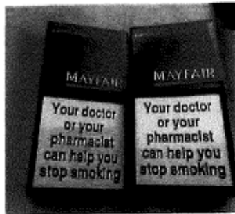
Exhibit EVE1/5078/05/01/22 refers as pictured.

Examination of all three exhibits (EVE1/5078/09/09/21 - Exhibit EVE1/5078/30/09/21 - EVE1/5078/05/01/22) confirmed that they are counterfeit.