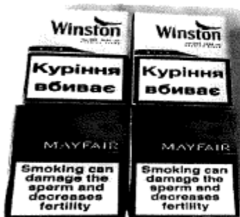
Exhibit EVE1/5078/09/09/21 refers as pictured.

30/09/21 1605hrs – Two (2) packets of 20 Mayfair Cigarettes purchased for a total of £10.00. Exhibit EVE1/5078/30/09/21 refers as pictured.